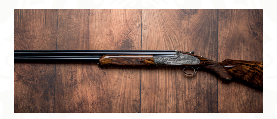
The 12-bore lock plates feature hunting scenes of bobwhite quail in Georgia.