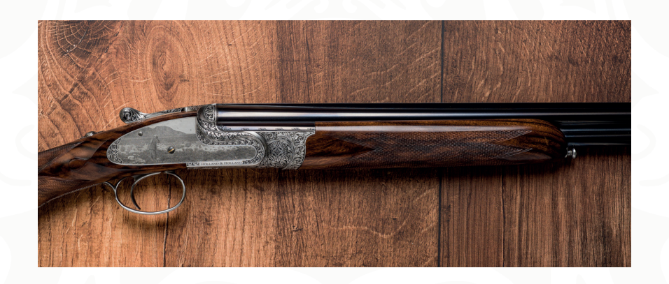
The .410 lock plates feature hunting scenes of Montezuma quail in New Mexico.