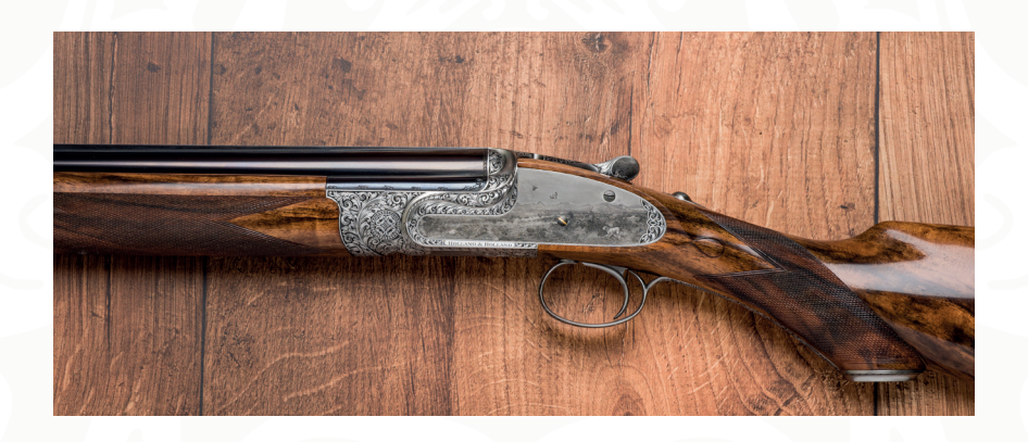
The 28-bore lock plates feature hunting scenes of scaled quail in Texas.